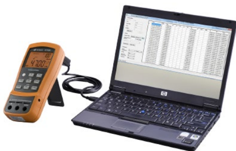
Figure 1. Automate the recording of continuous readings when you hook the U1731C/U1732C/U1733C to a PC

The handheld LCR meters allow you to test various component types, including secondary components of Dissipation Factor (D), Quality Factor (Q), and Angle Indication of Impedance ( \theta ). This new handheld series also includes other functions that result in a more detailed component analysis. For example, the built-in Equivalent Series Resistance (ESR) function helps you better understand the inherent resistance behavior typically found in capacitors across selected frequencies. DCR is a built-in DC resistance measurement that eliminates using a separate digital multimeter (DMM) for component tests.