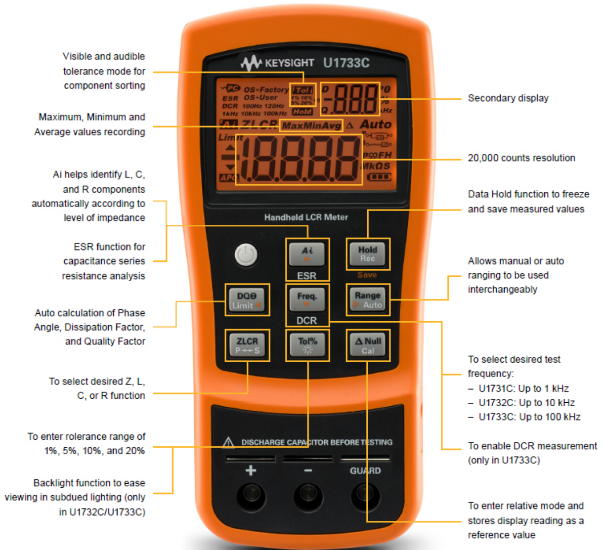
Figure 2. Front view of the U1733C