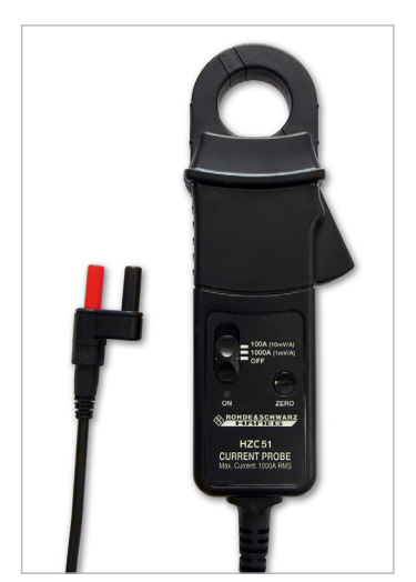
R&S®HZC51 AC/DC current probe

The R&S°HZC815 adapter makes it easy and safe to connect a DUT to the R&S°HMC8015. The DUT is powered via the appliance coupler on the top of the adapter.