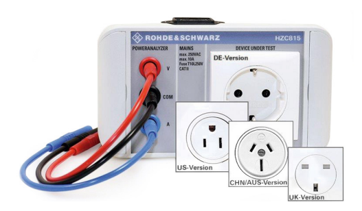
DE, UK, CHN/AUS and US versions of the R&S°HZC815