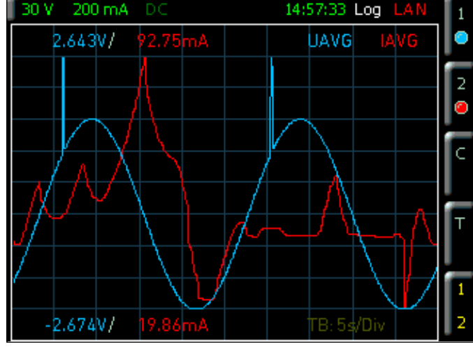
Trend chart function