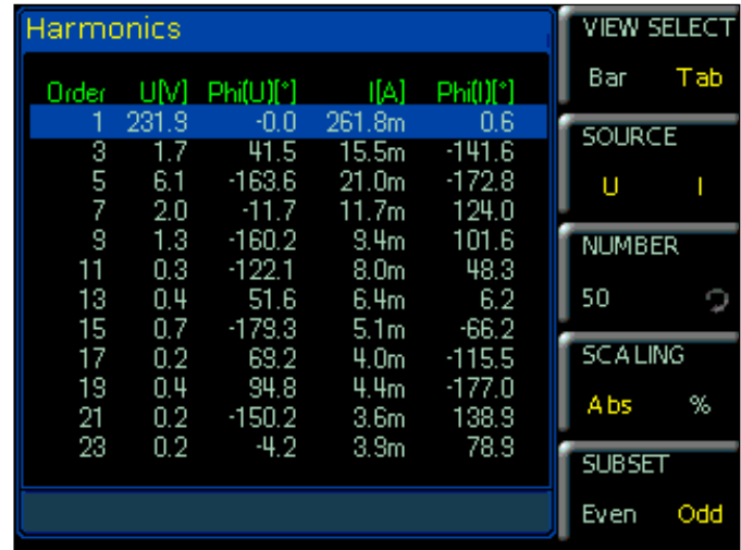
Harmonic analysis: tabular display