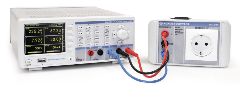
R&S®HMC8015 power analyzer with the R&S®HZC815 adapter